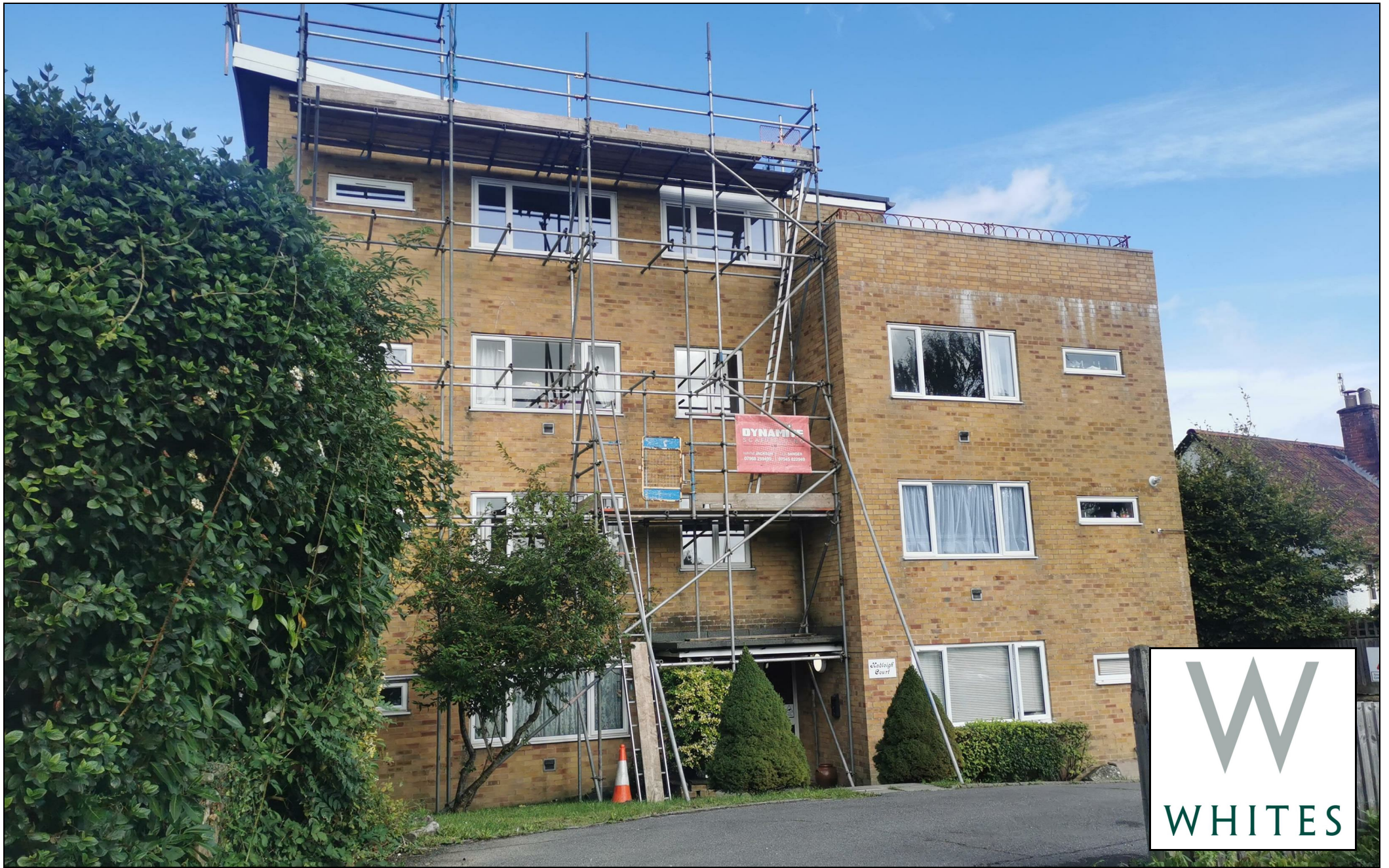
Flat 4, Hadleigh Court Shady Bower, Salisbury, Wiltshire, SP1 2RJ